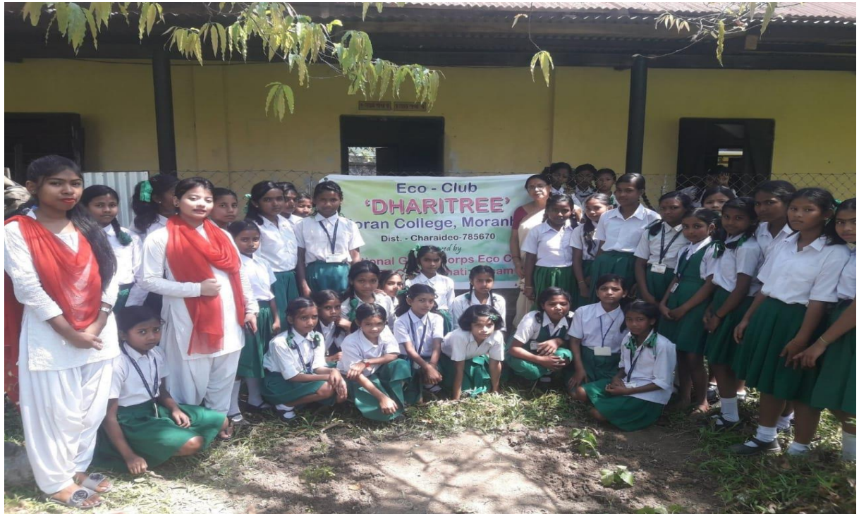
Plantation drive at by ECO-CLUB Moran College at Moran Girls'High School, Moranhat, Charaideo.