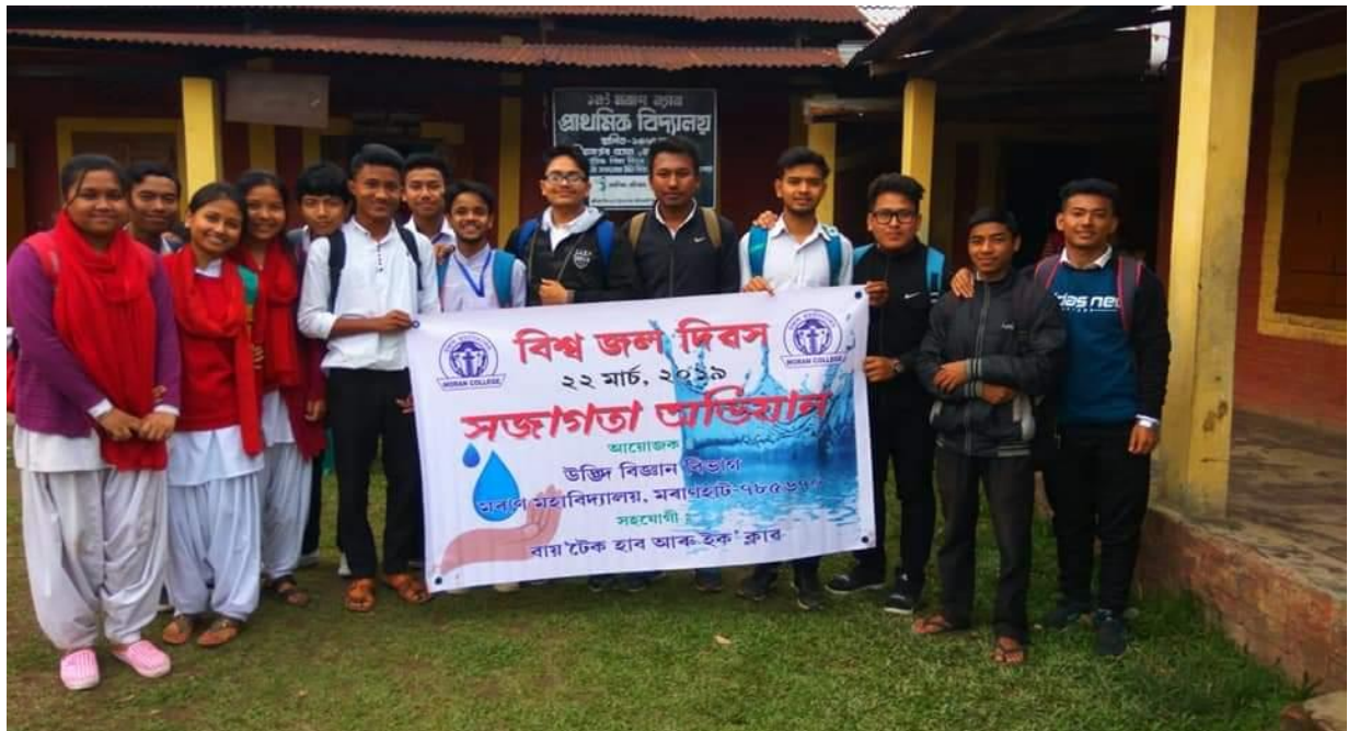
Awareness program on sustainable use of water on the occasion of World Water Day at School organised by Department of Botany in association with ECO-CLUB & No.1 Moran Town L.P. School