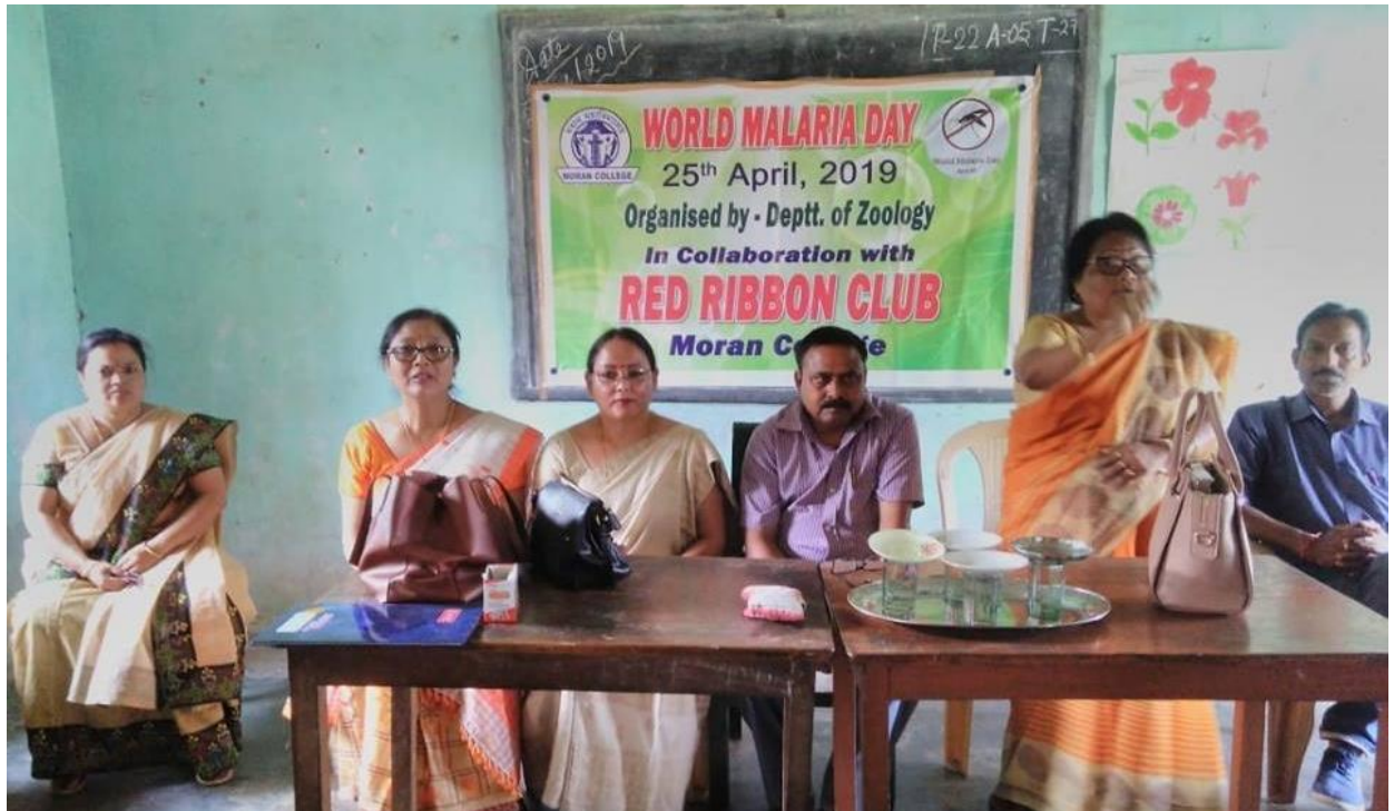
Awareness campaign for malaria disease at nearby schools, organised by Department of Zoology in association with Red Ribbon Club, Moran College