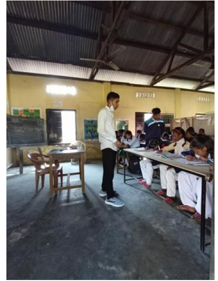
The B.A 4 th semester students of the department of Education teaching in Moran Balika Uccha Madhyamik Vidhyalaya