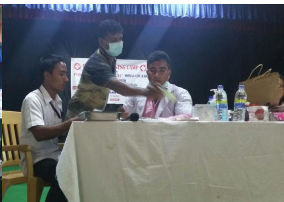
Free Dental Check up Camp organized by Personality Development Cell. Other than college students, people from neighbourhood area came for free check up