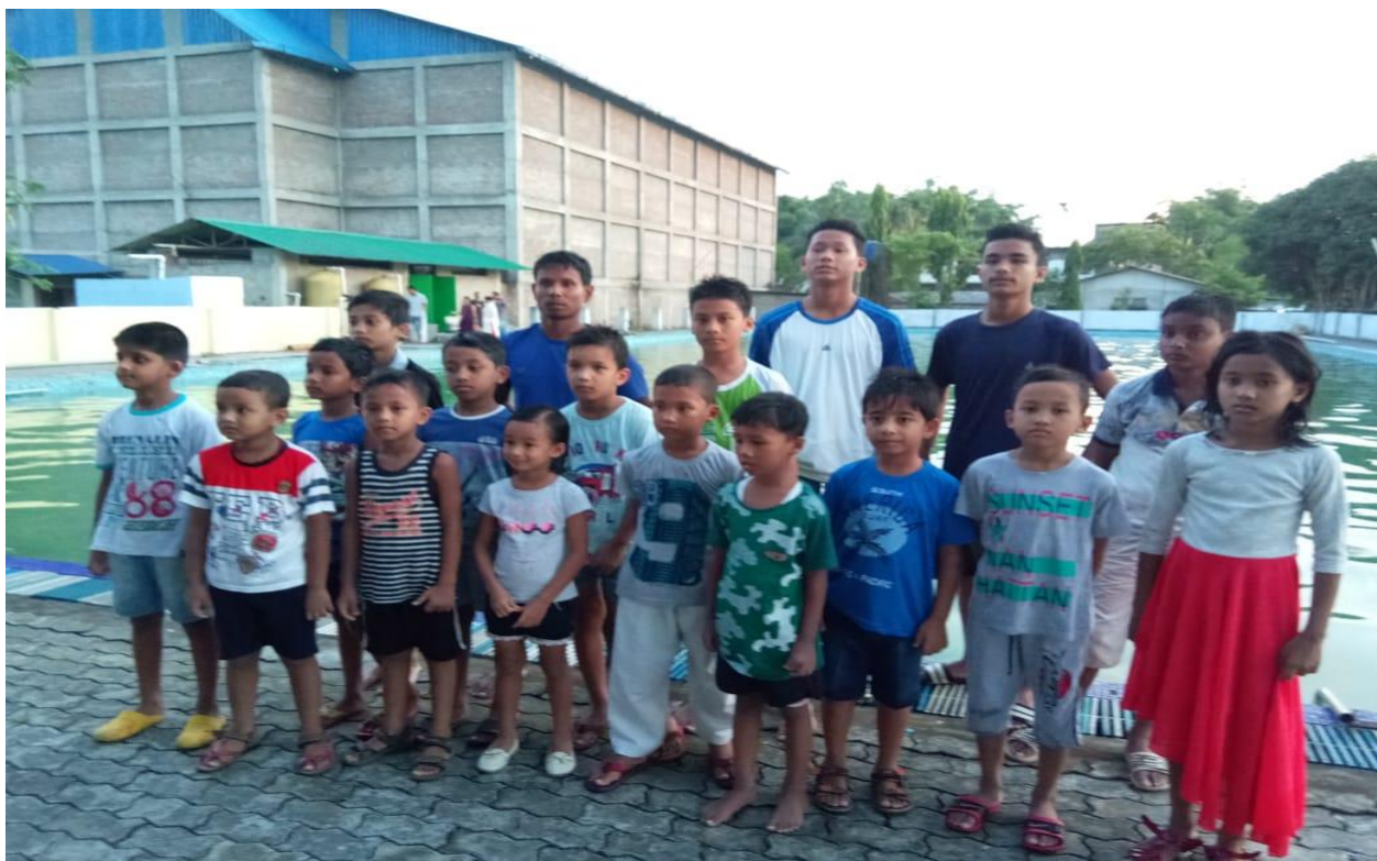
Trainees at swimming pool Moran College from neighbourhood localities