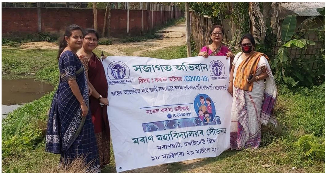
Awareness campaign on COVID-19 started from Office of the Circle Officer, Mahmora Revenue Circle and in the areas surrounding the college campus.