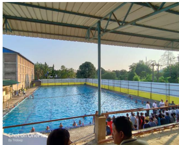
Inter-district Swimming Competition organized at Swimming Pool, Moran College.