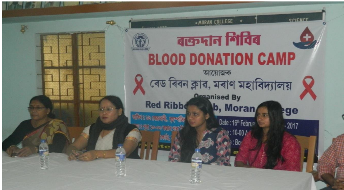
Under health awareness drive, blood donation camp organised by Red Ribbon Club, Moran College