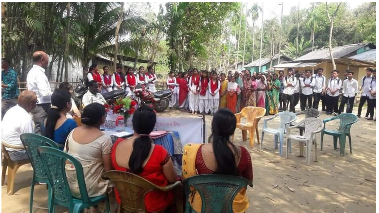
Awareness camp on stopping consumption of stove wine at Hajua Tea Estate arranged by Department of Economics.