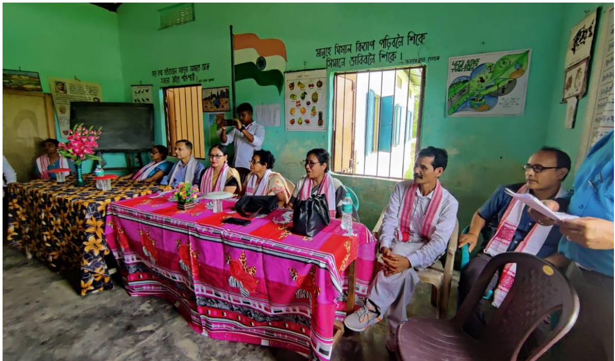
Awareness program of environment day at Shramik Nabajyoti Primary school, aorganised by Botany Department in association with ECO-CLUB, Moran College.