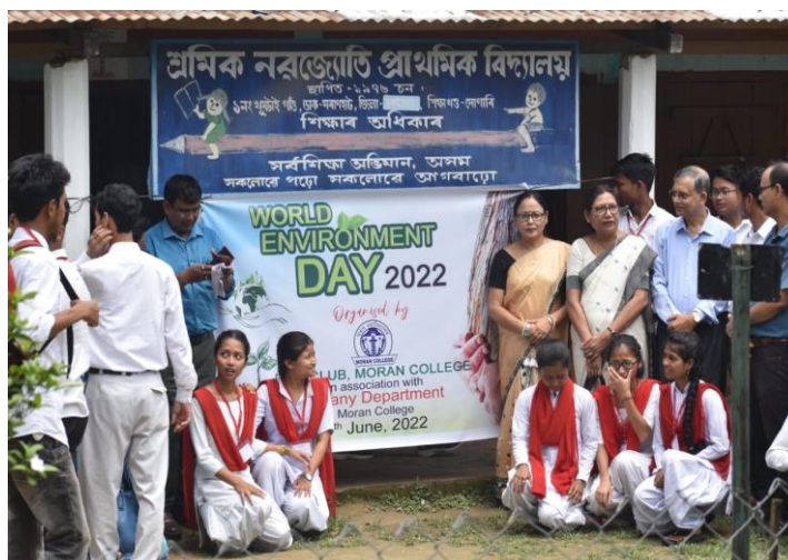
Student and faculty of ECO-CLUB Moran College at Shramik Nobojyoti Prathamik Vidyalay, Moranhat