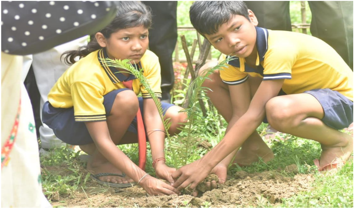
Tree plantation by the little students of Shramik Nabajyoti Primary School.