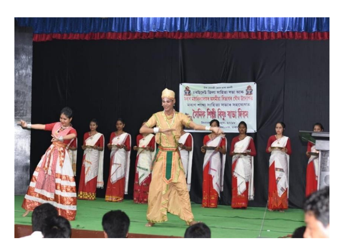
Celebration of Rabha Divas