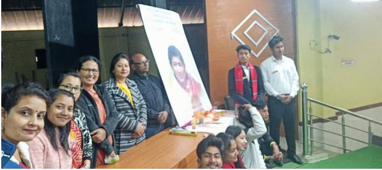
The college pays tribute to legendary singer Lata Mangeskar on her death anniversary