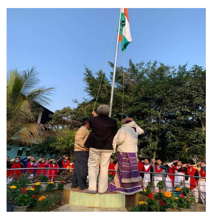
Celebration of Republic Day