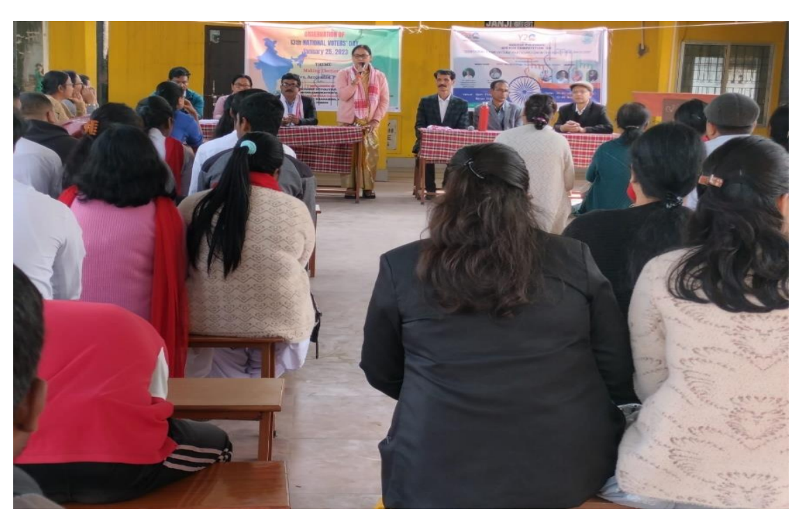
The College organizes Speech Competition during National Voter's Day