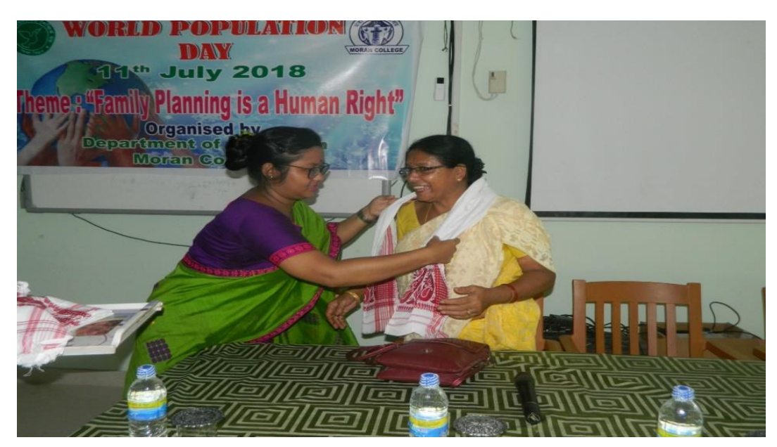
World Health Day