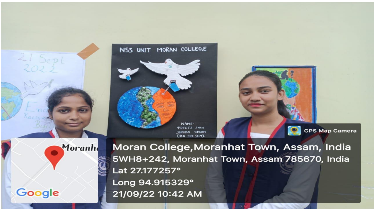
The NSS Unit takes special initiative to celebrate World Peace Day