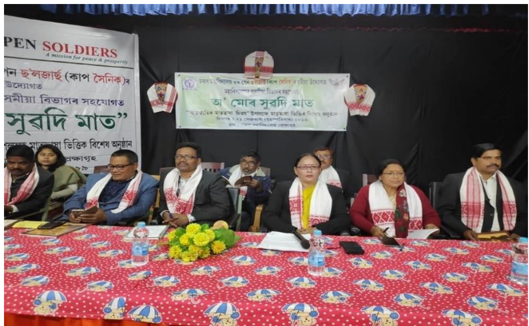
International Mother Language Day