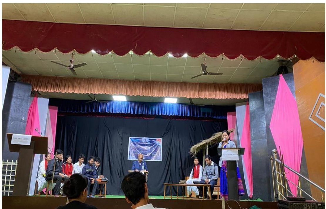
The college takes initiative to G20/Y20 Pre-events