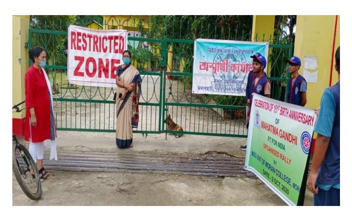
Social Responsibility during Covid-19 Global Pandemic