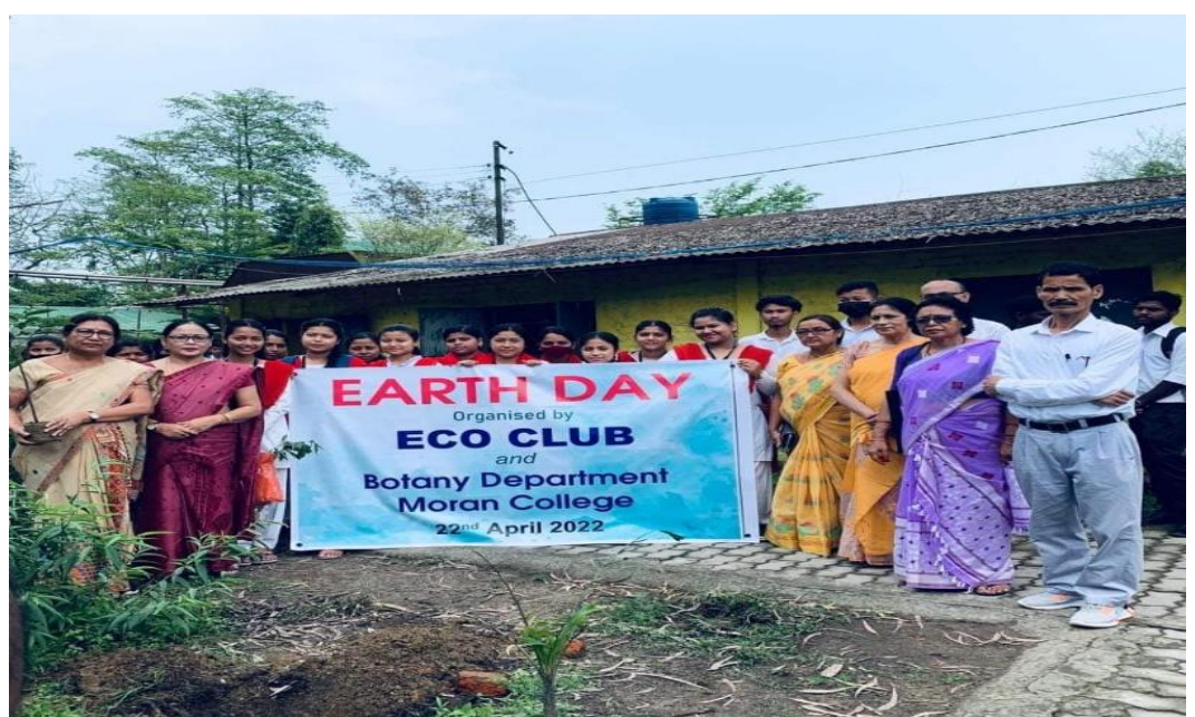
World Earth Day