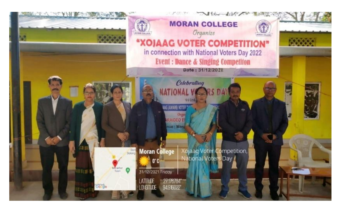
The college organize Dance and Singing Competition on the occasion of National Voter's Day