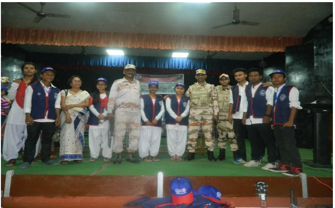
The college proudly celebrates Surgical Strike Day