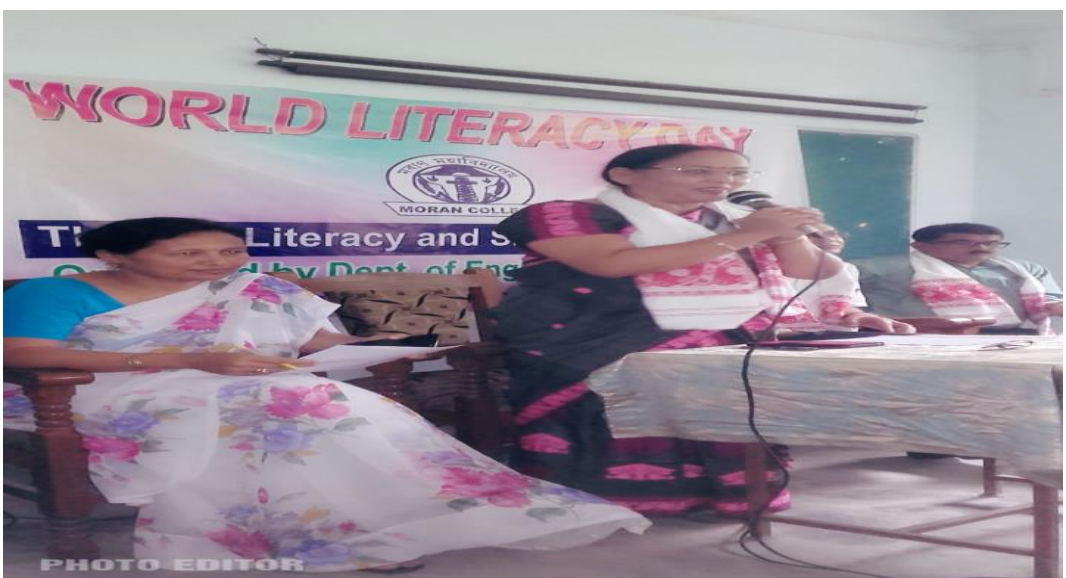
World Literacy Day