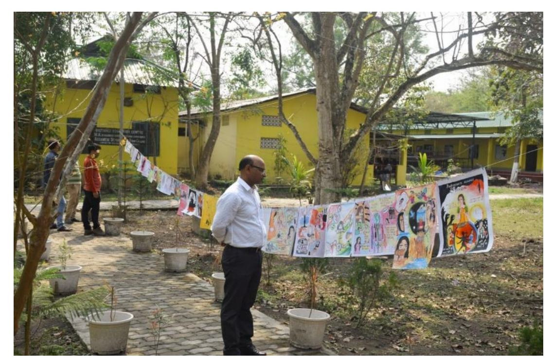
The college organizes Poster Making Competition on the theme Unity is Strength