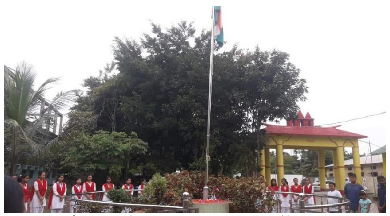
Celebration of Independence Day as a symbol of freedom